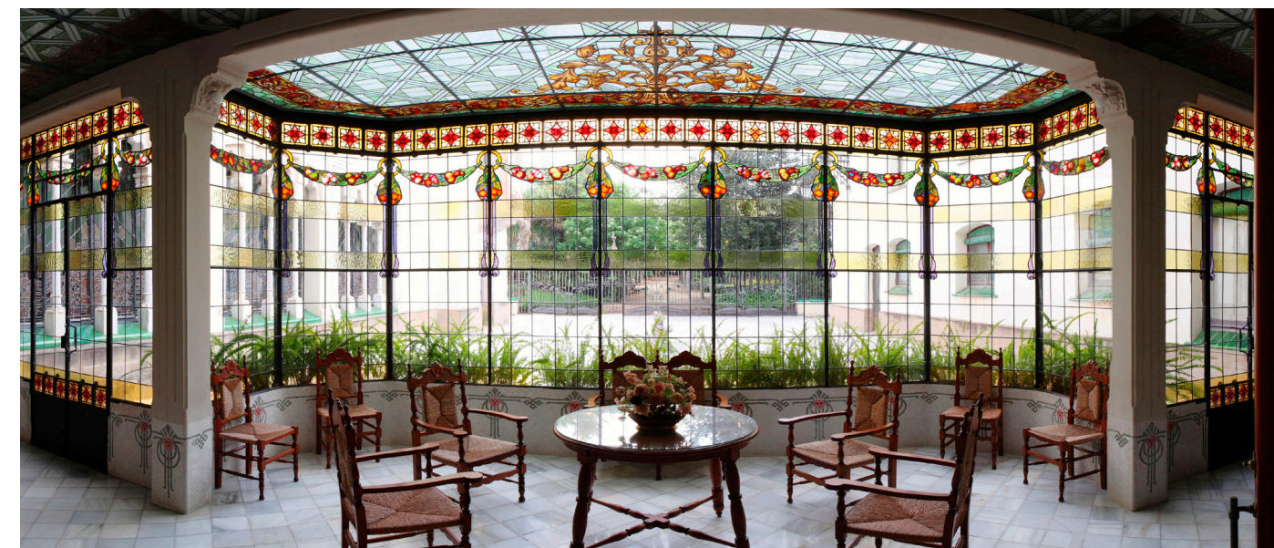
© Casa Alegre de Sagrera de Terrassa