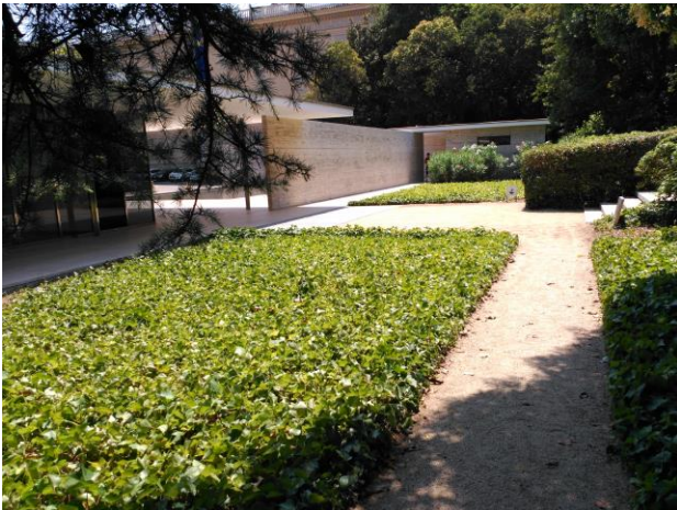
Connection with the Pavilion