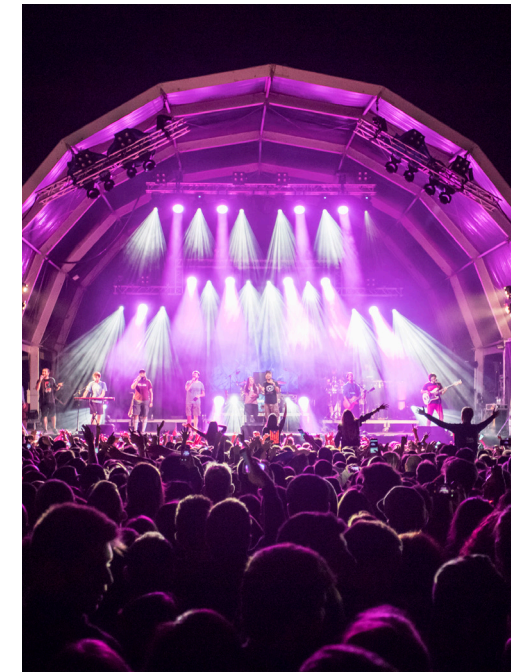
Mercat de Música Viva de Vic