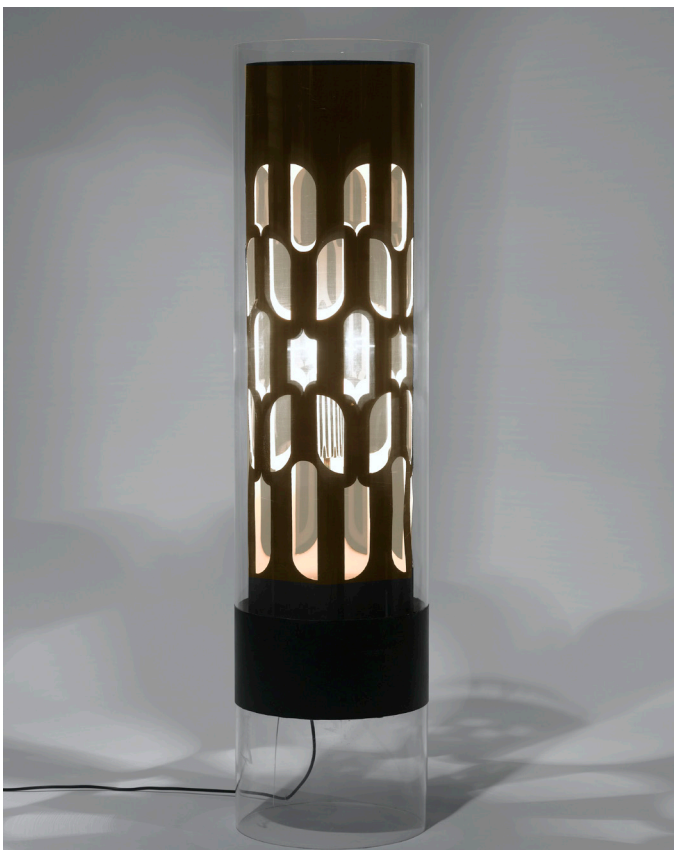
Black light at CCCB

Until Jan 31, 2019. This show looks at the unique relationship between people and robots.