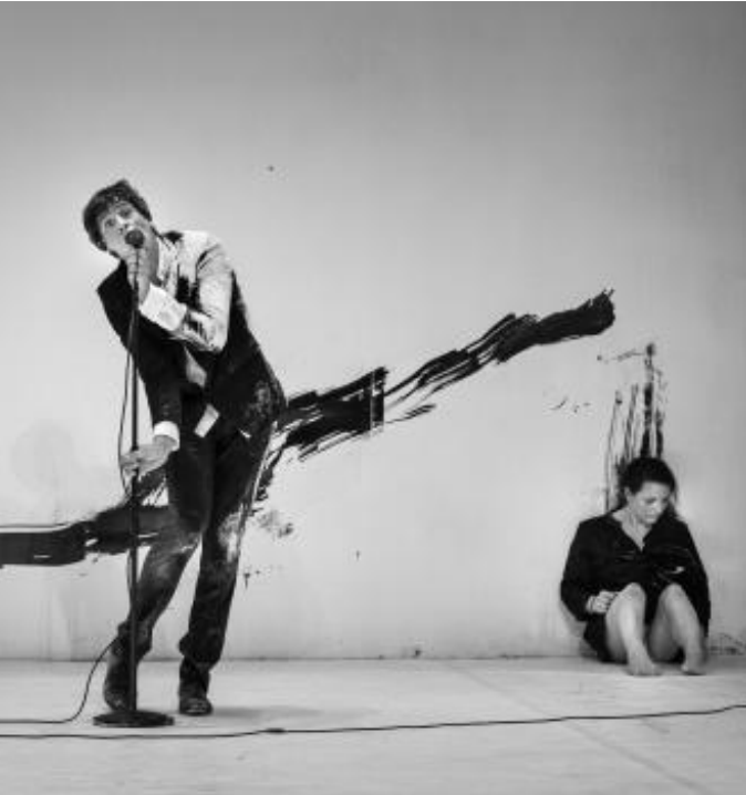
Là. Teatre Lliure.

Teatre Gaudí Barcelona (Sant Antoni Maria Claret, 120). M: Sagrada Família (L2, L5) and Sant Pau/Dos de Maig (L5). www.teatregaudibarcelona.com/es/