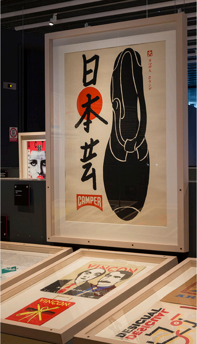
Do you work or design? Museu del Disseny de Barcelona

Until Dec 30. Discover 17 pieces selected from the museum's collection on the theme of gardens.