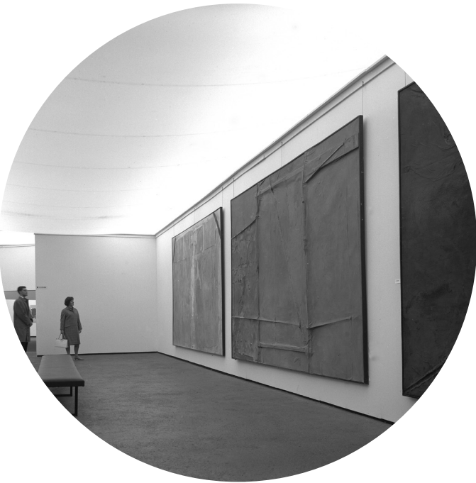
Political biogrophy. Fundació Antoni Tàpies