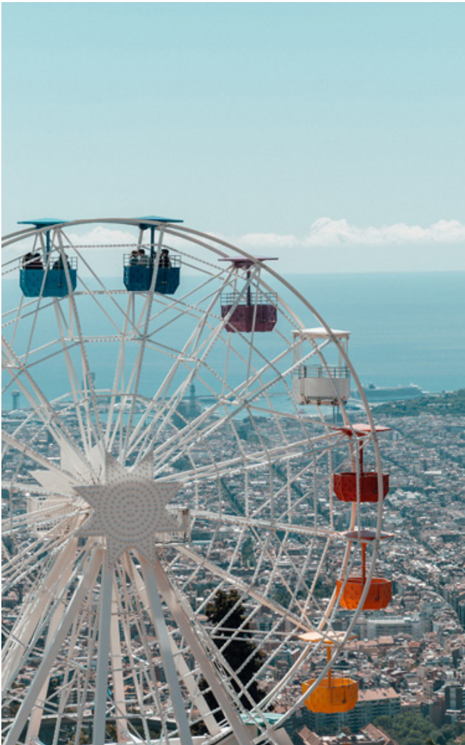
Tibidabo. Amusement Park