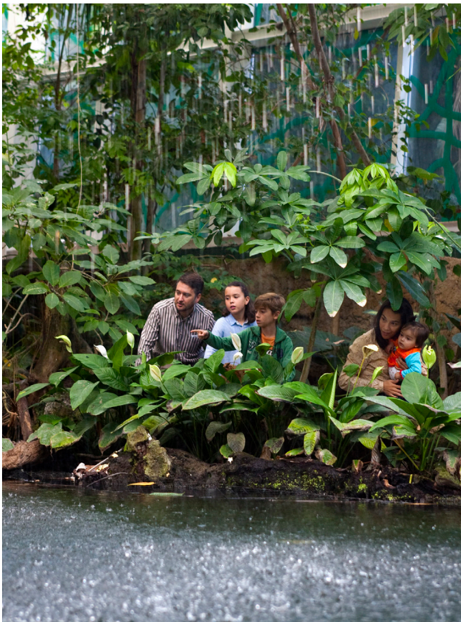
The Flooded Forest. Cosmocaixa