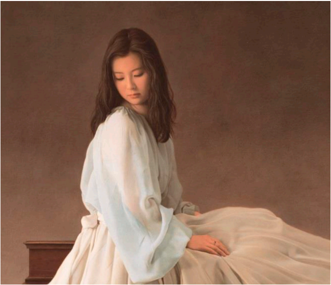
The realist painters of Japan. Museu Europeu d'Art Modern