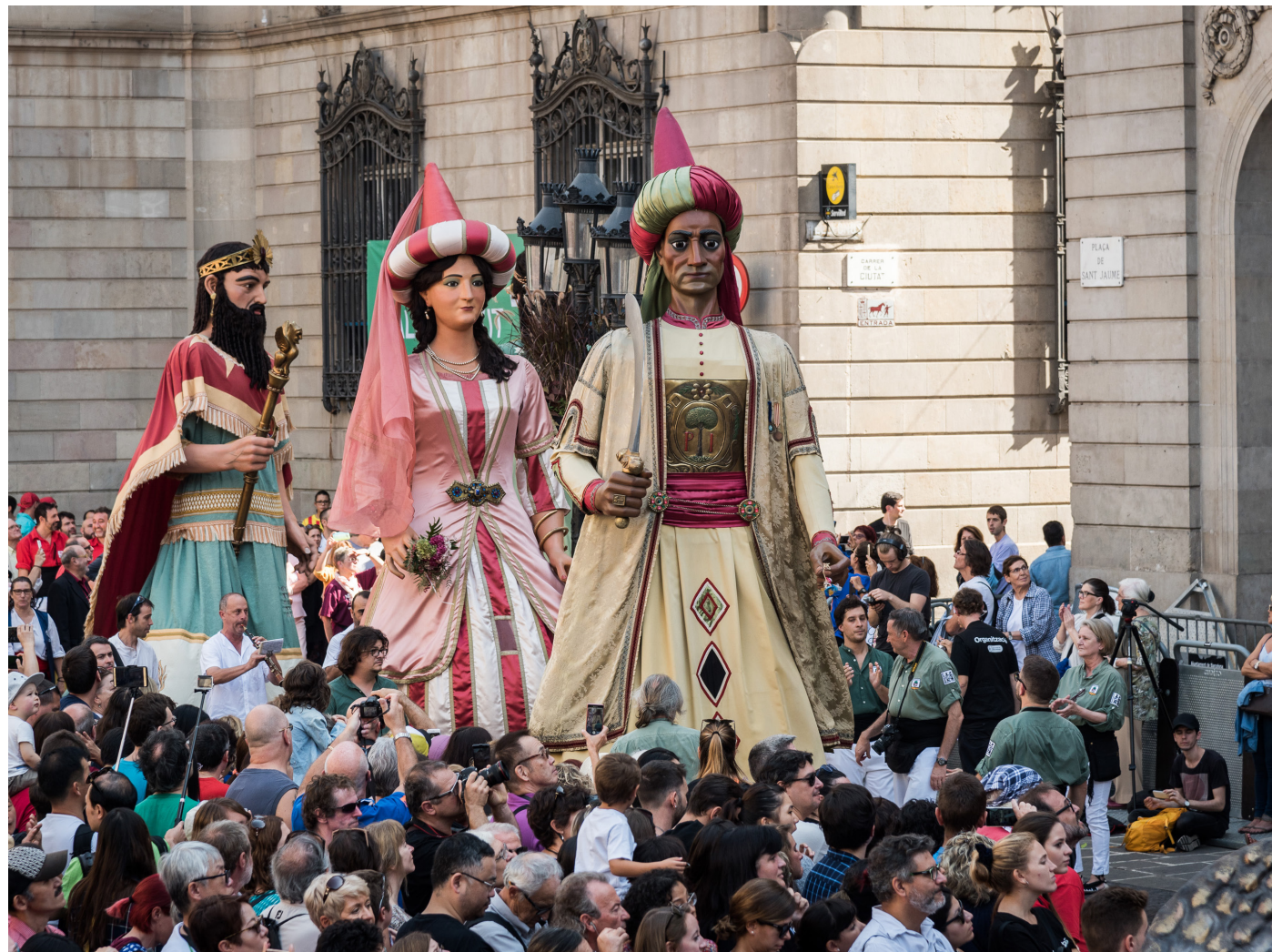
Gegants. La Mercè

It's that time of year again, when a back-to-school September feeling is matched by the start of a certain freshness in the air. In Barcelona, peak beach season is drawing to a close and the city's attention is turning once more towards other activities such as visiting museums and art galleries, enjoying live performances, celebrating local culture and traditions (this month sees Barcelona go all out to mark the feast day of its co-patron saint, La Mercè), and relishing all that this open, diverse, unique and unforgettable place has to offer.