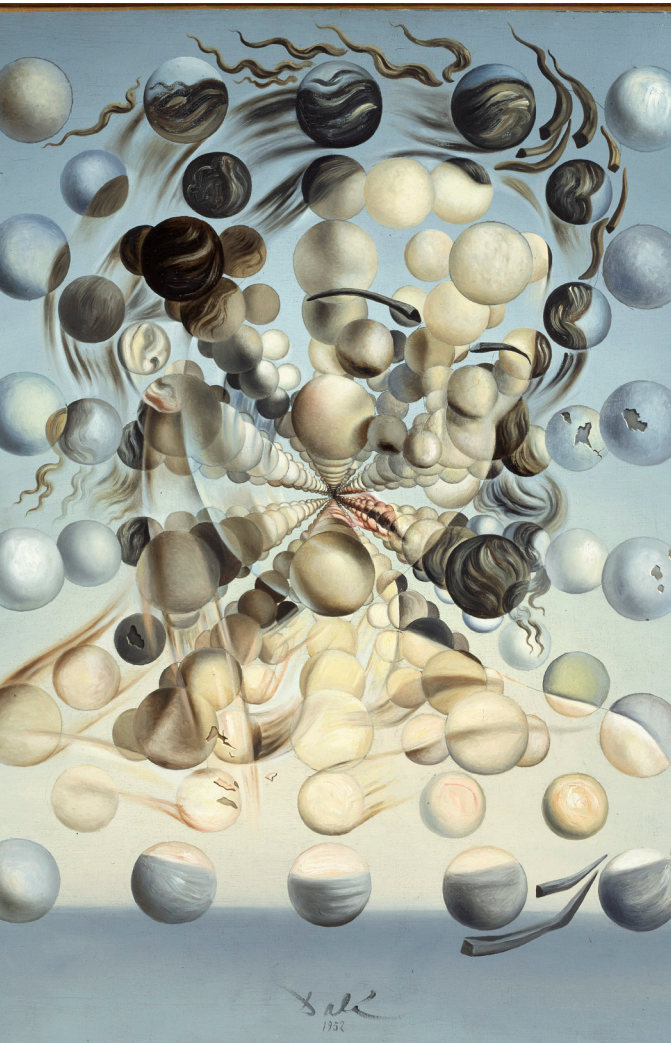
Salvador Dalí. Gala Placidia. Glate of the Spheres © Salvador Dalí, Fundació Gala Salvador Dalí

created by single-use plastic, the museum looks at an alternative material: hemp plastic, which is light, durable and biodegradable.