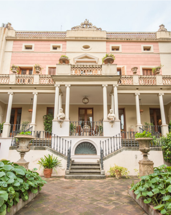
Casa Rocamora. Cases Singulars