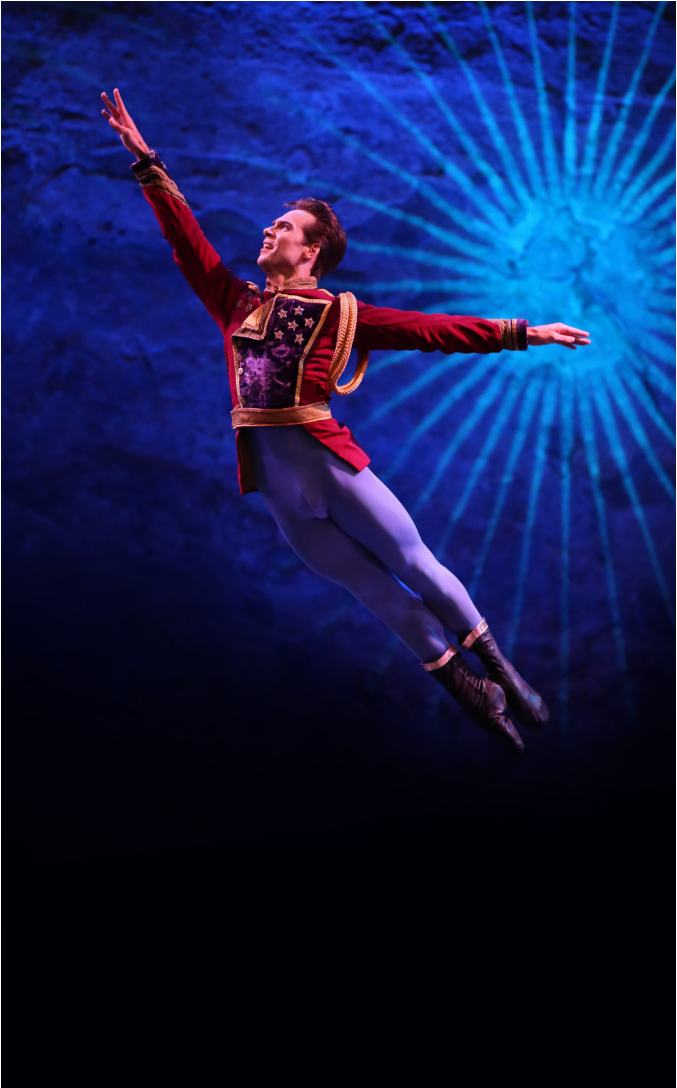
IBStage Galas at Gran Teatre del Liceu