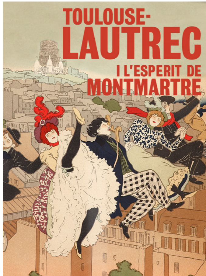
Toulouse-Lautrec and the spirit of Montmartre. Caixaforum

Oct 24-March 31, 2019. Wide-ranging exposition that features the entire oeuvre of film director Stanley Kubrick (1928-1999), including large-screen projections of key scenes, and documentary audio and video