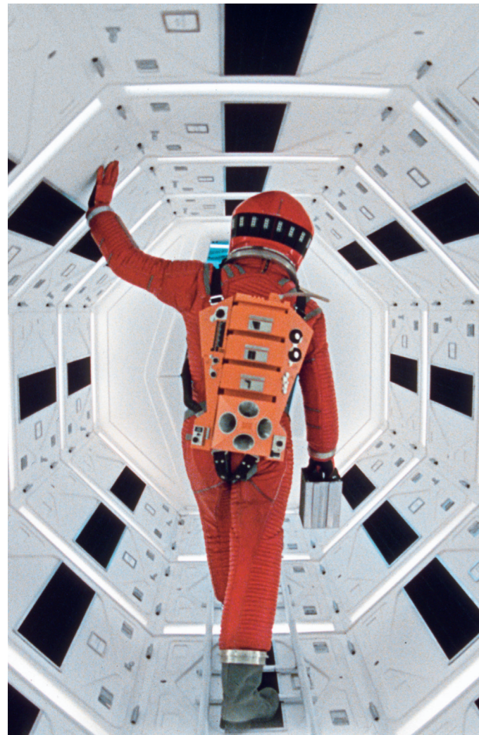
2001: A Space Odyssey. © Warner Bros. Entertainment. Inc. at CCCB

(L3), Barceloneta (L4). Daily 10am-10pm; public holidays 2pm-10pm. www.hashmuseum.com