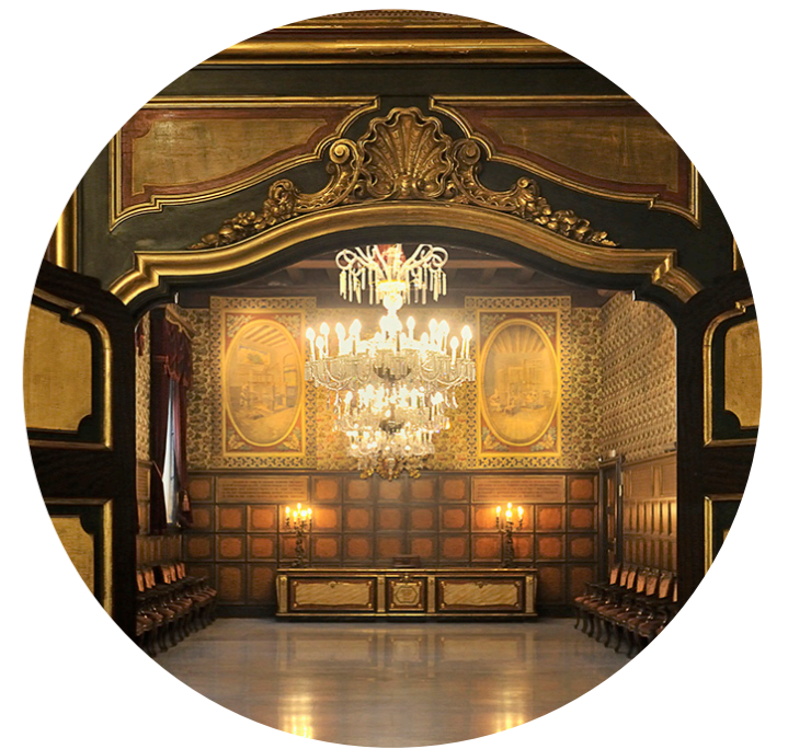
Casa de la seda

(Start: Turisme de Barcelona Tourist Information Point, Plaça Catalunya, 17, basement). M: Catalunya (L1, L3; FGC). Sat 4.30pm-9.30pm. From 44.10€ Combined walking and bus tour that includes many of Barcelona's most famous sights as well as supper at the Modernista Hospital de Sant Pau, the light, water and colour show of the Magic Fountain, and panoramic views of the city by night from Montjuïc.