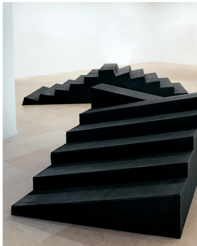
Open Works. Art in Movement. Fundació Catalunya-La Pedrera

material that sheds light on the filming process.