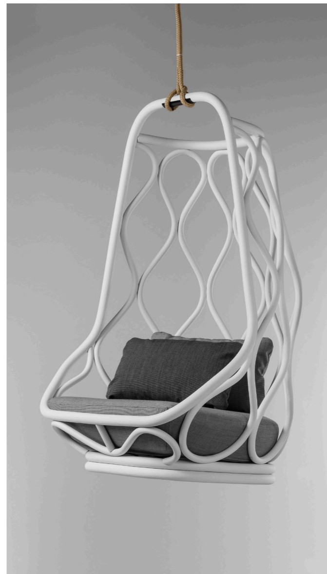
The magic curve. Museu del Disseny de Barcelona

Until Dec 30. The featured work in the display case of the museum's garden is a mid-