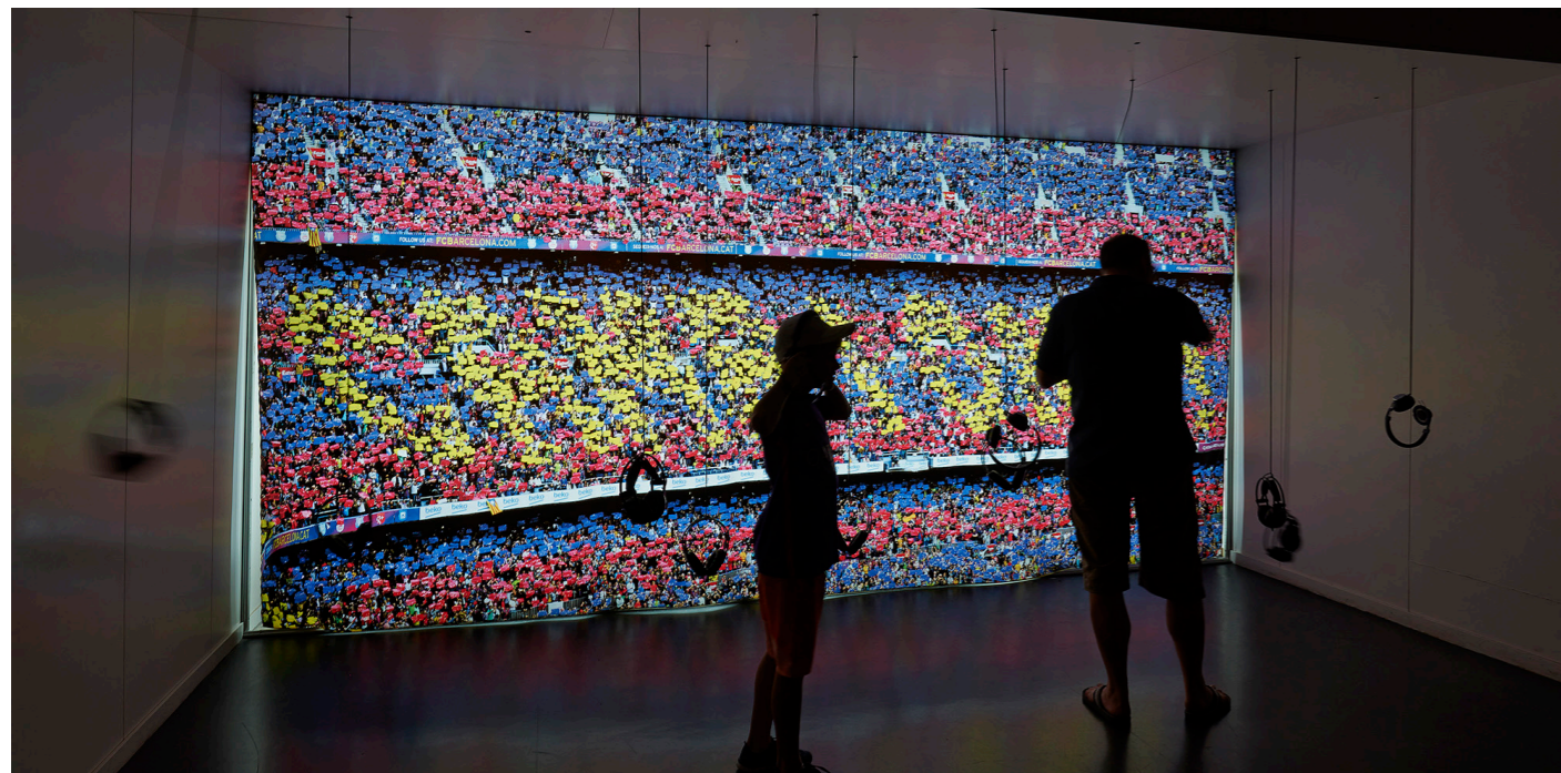
Museu del Futbol Club Barcelona

Permanent exhibition exploring the lineage of the Montcada family and its close relationship with the Monastery.