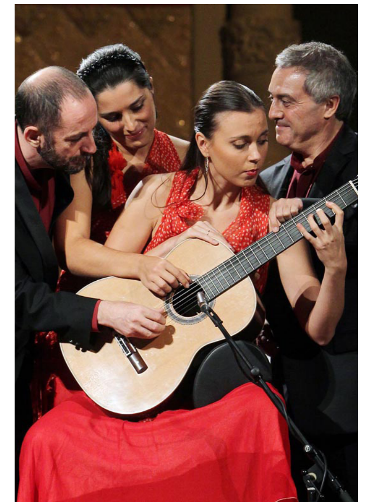
Spanish guitar concert at Palau de la Música

Palau de la Música Catalana (Palau de la Música, 4-6). M: Urquinaona (L4). www.palaumusica.cat/en . These city centre venues host regular performances of two shows that celebrate the beauty of two musical genres. The first, Opera and flamenco, is a love story that tells the tale of a tempestuous affair between flamenco dancers who perform to some of opera's most famous arias. The other is Grand Flamenco Gala, offering the chance to hear the most traditional sounds of classic Spanish flamenco, with an intense performance full of passion.