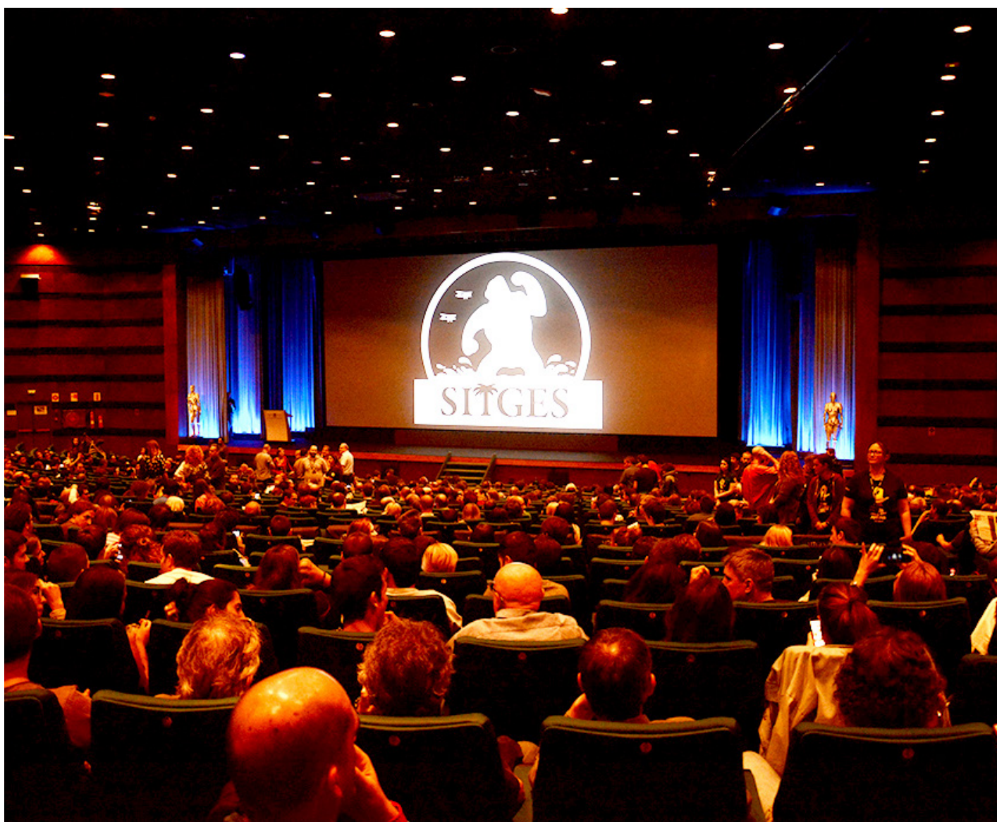
Festival Internacional de Cinema Fantàstic de Catalunya