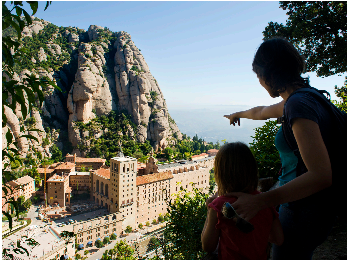
Monistrol de Montserrat. European Heritage Days

October is an inviting, busy month in Barcelona. It's still warm enough for being outdoors while many cultural centres, including art galleries and music venues, launch their new seasons with events for all tastes. A variety of festivals are also on the agenda, with jazz, architecture and film among the featured subjects, and important sporting events take place including the Barcelona Triathlon and the world championship of pelota vasca (a sport worth discovering if you're not familiar with it!). Not far from the city, you'll find cultural festivals, cava tastings and the chance to discover life as it was 100 years ago at a Modernista workers' colony. Barcelona – a place with always so much to do!