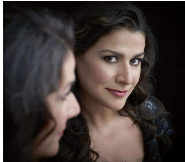
Cecilia Bartoli at Palau de la Música Catalana