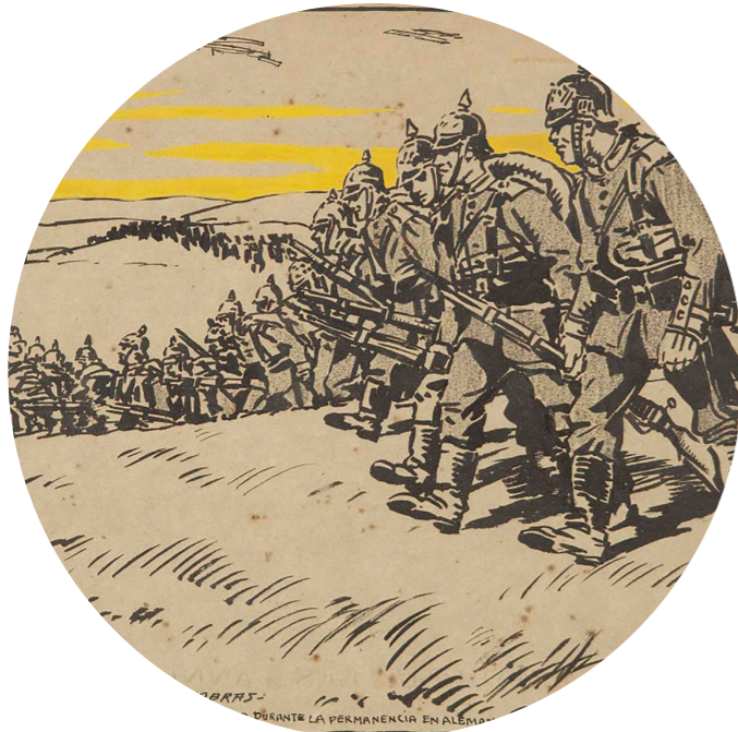
Llorenç Brunet. War drawings. Museu de Badalona