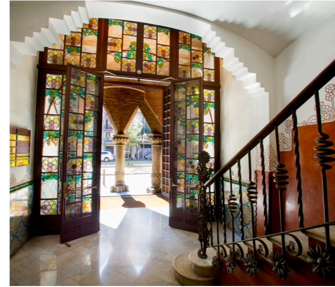
Casa de les Punxes

(Av. Diagonal, 373). M: Diagonal (L3, L5); FGC: Provença. Wed 11am (Eng), 1pm (Spa). 10€. This building was remodelled by Josep Puig i Cadafalch