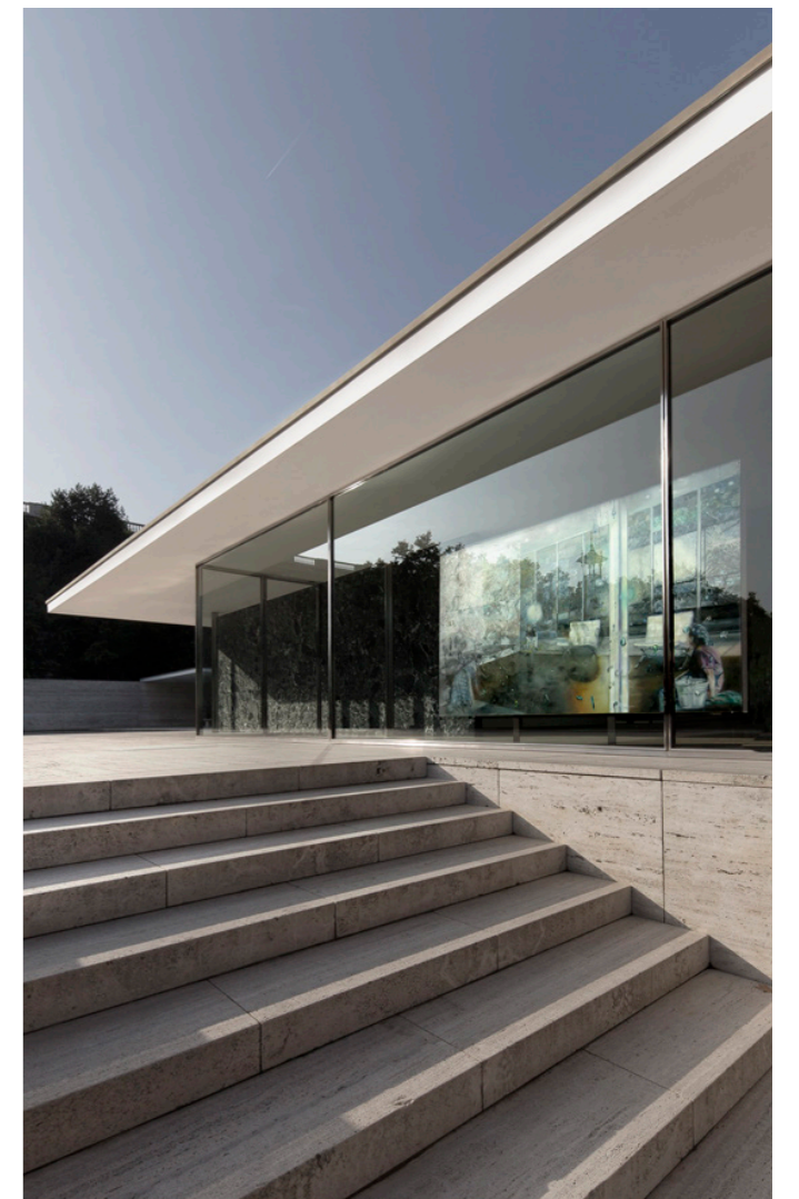
Pavelló Mies Van der Rohe