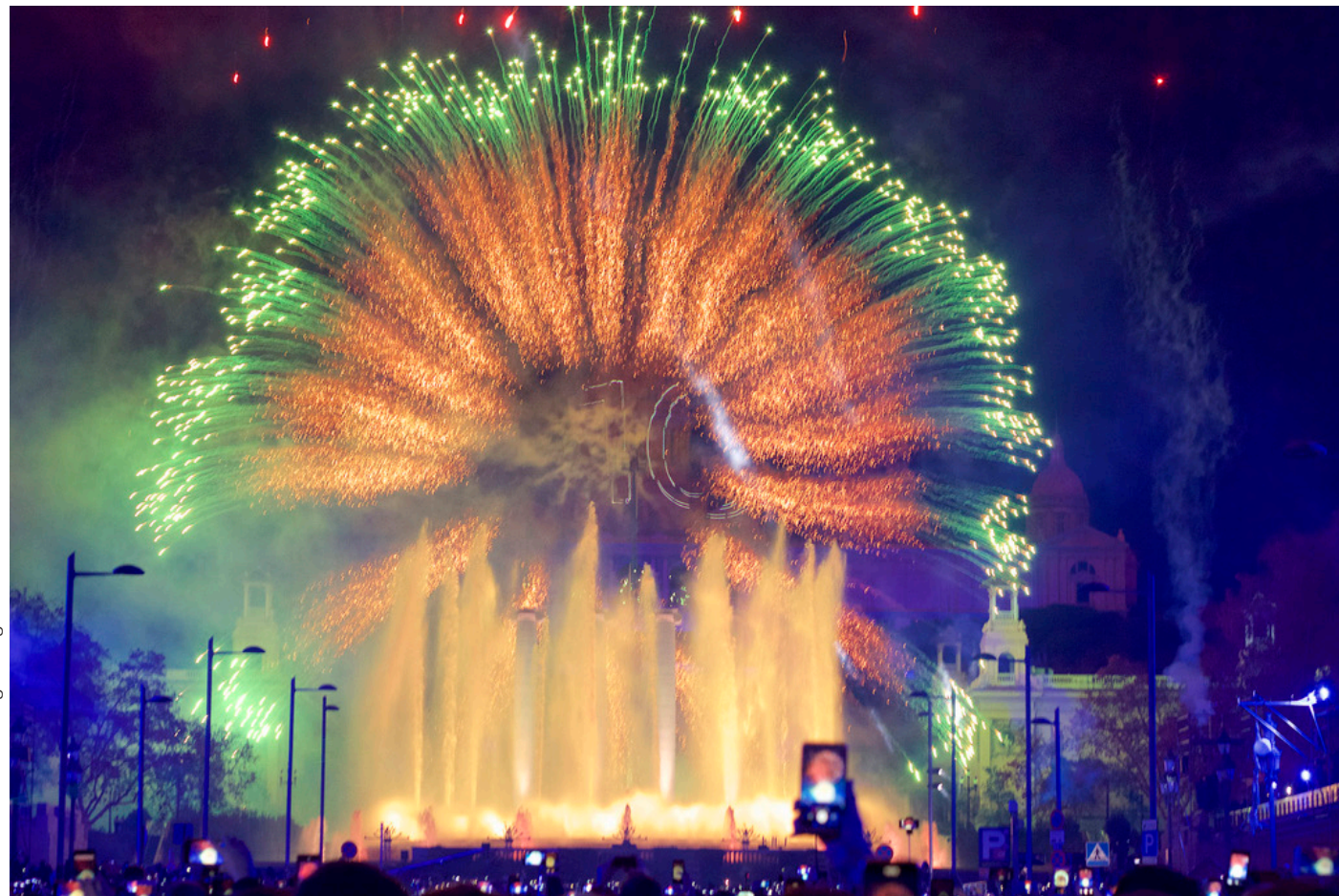
New Year's Eve.

Barcelona is a wonderful place to be at any time of the year, but in December the city takes on a magical vibe you won't find elsewhere. The sun is still shining, the sky is blue, you can enjoy café terraces and explore the streets and neighbourhoods. And everywhere you go, you'll find Christmas: markets, concerts, family activities, numerous shops offering original gifts, restaurants serving traditional and contemporary festive Catalan dishes, and lights everywhere bringing sparkle to the dark nights. What's more, outside the city, you'll find a range of memorable cultural events to enjoy from fairs of pine trees and roosters to a torch procession and living nativities, as well as great days for all the family at PortAventura World . In Catalonia, the days of celebration are December 24 ( Nit de Nadal ), 25 ( Nadal , which is marked with a splendid, multi-course feast), 26 ( Sant Esteve , when the main dish for lunch is a plate of cannelloni made with the leftover meat from Christmas Day), 31 ( Cap d'Any , celebrations to welcome the new year) and January 1 ( Any Nou ).