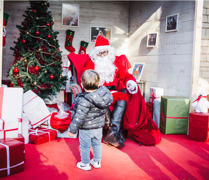
Christmas at Poble Espanyol

(Camí de l'Observatori, s/n). To get there, you need a car or can take a taxi. Evening guided tours: Fri (Cat/Spa), Sat (Cat/Spa/Eng); 15€/25€. Head to Barcelona's