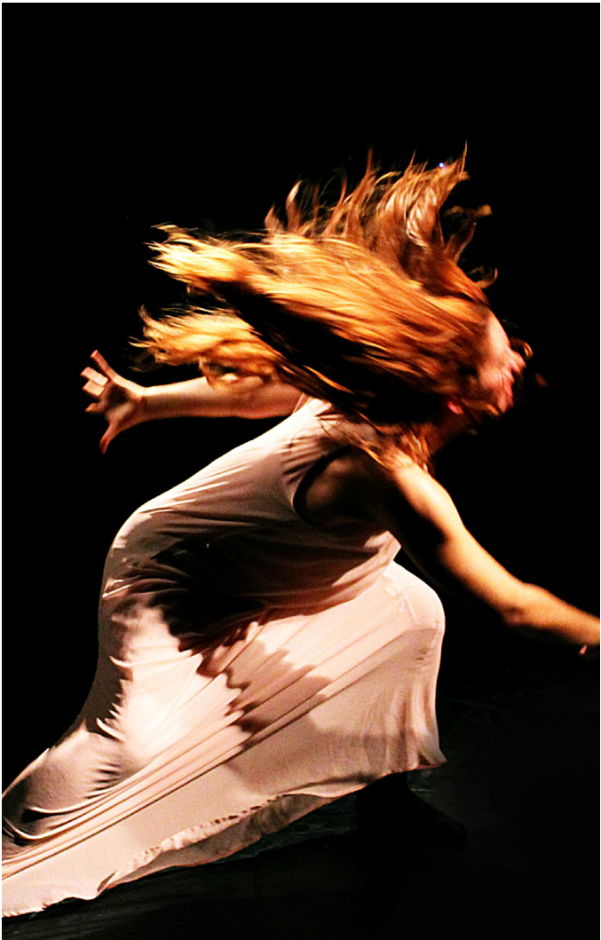
Carrie. Teatre Gaudí Barcelona