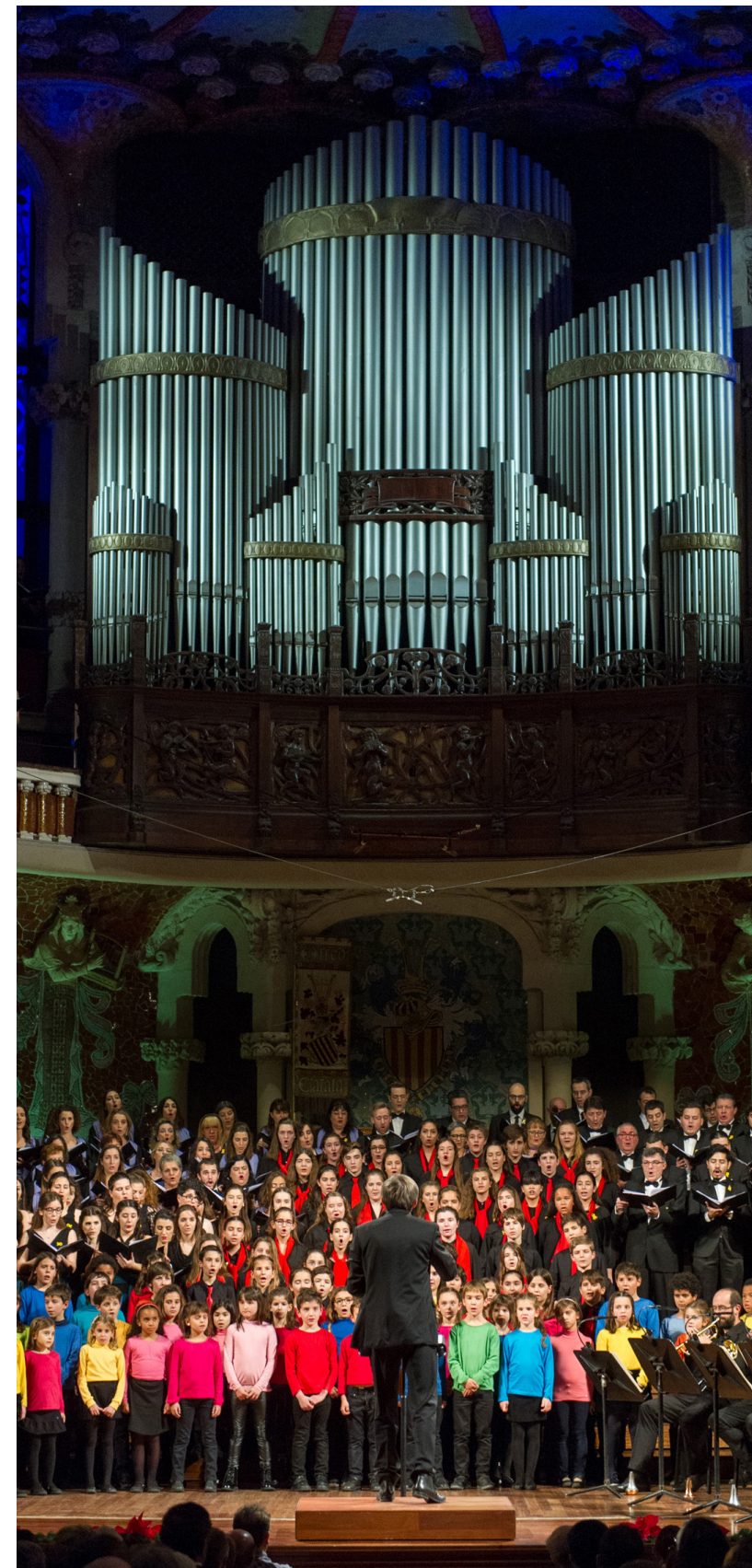
Saint Stephen's Concert. Palau de la Música Catalana