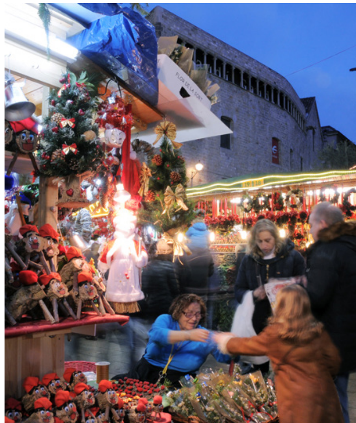
Fira de Santa Llúcia

More information at barcelona.cat/en/christmas and visitbarcelona.com