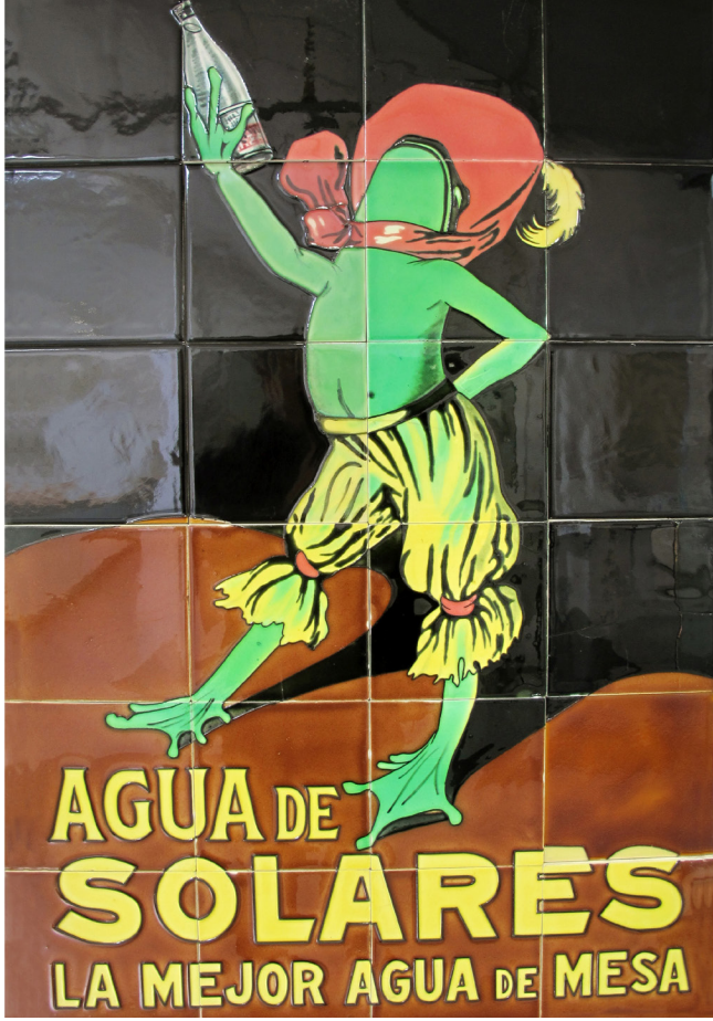
The advertising boom. Museu del Disseny. Agua de solares.

(Passeig de Santa Madrona, 16-22). M: Poble Sec (L3), Espanya (L1, L3; FGC). Tue-Sat 10am-7pm; Sun and public holidays 10am-8pm. Closed Mon, Dec 25 and