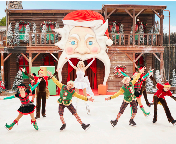
Christmas at Port Aventura Park

Tibidabo theme park BUY (Pl. del Tibidabo, 3-4). Bus Tibibus (T2A) from Pl. de Catalunya. FGC: Av. Tibidabo (L7) + Bus 196 + Tibidabo Funicular. See link for opening times. From 27.08€. New and classic rides, plus amazing views across the city. And this month, the park's special Christmas schedule includes a new 4D film of The Little Prince, a festive Lego workshop and seasonal puppet show.