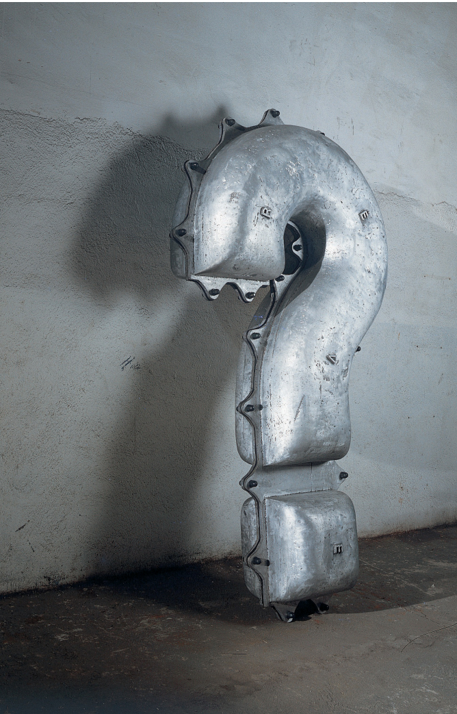
Jaume Plensa. MACBA

Catalan town of Sabadell before his international artistic career took off.