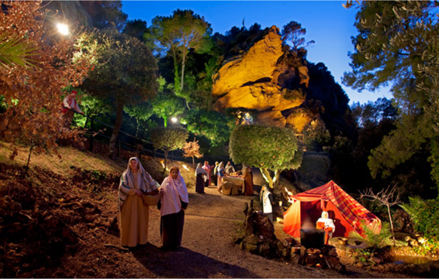
Pessebre vivent (living nativity). Corbera de Llobregat