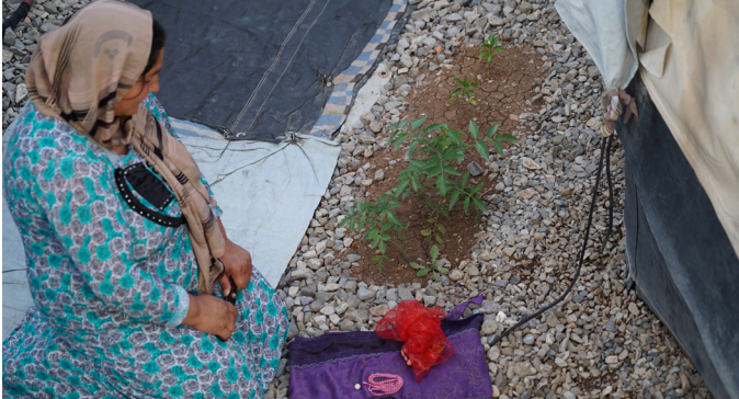
Purple Muslim. Giving voices. Fundació Antoni Tàpies

Eusebi Güell i Bacigalupi, patrician of the Renaixença Until Apr 30, 2019. A special exhibition that remembers Eusebi Güell, patron of Gaudí and the man who had the Palau Güell built for his family, on the occasion of the centenary of his death in 1918.