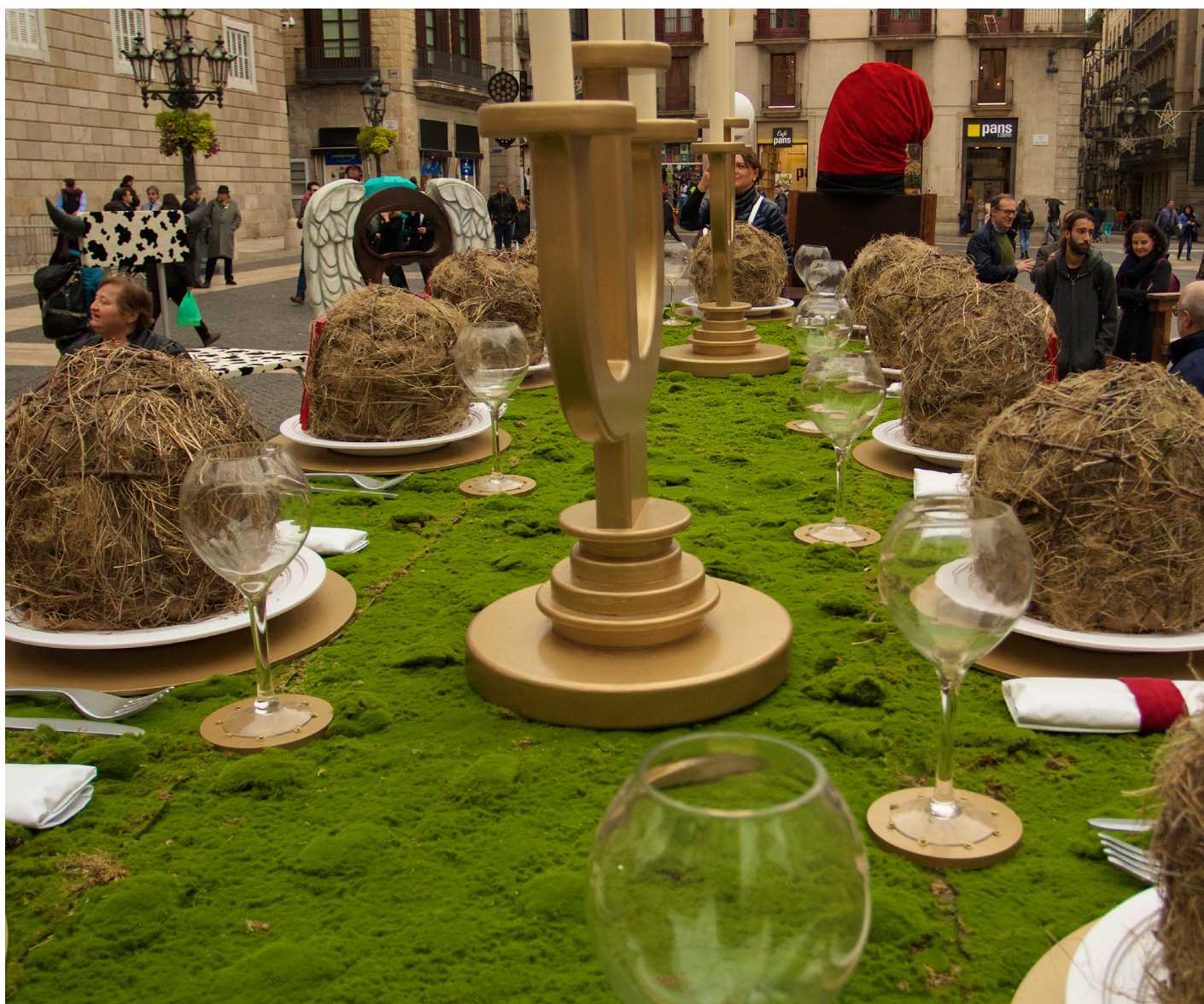
Plaça Sant Jaume nativity scene