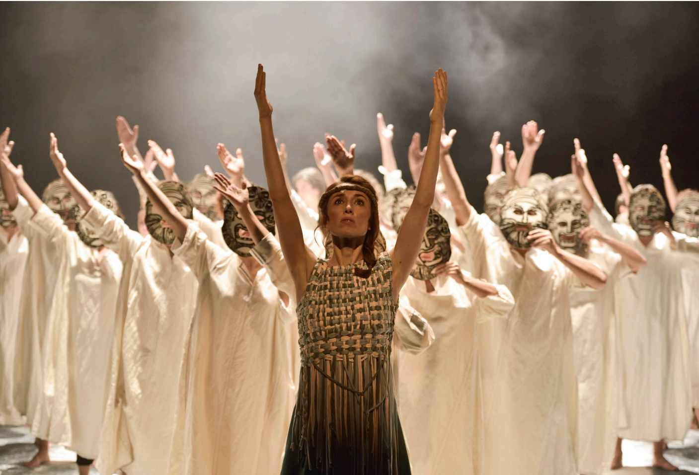
Troia, una veritable odissea. Teatre Nacional de Catalunya