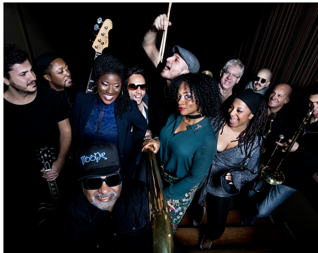
Incognito at Teatre Coliseum

Keeping Barcelona's music scene going during the whole of the traditionally quiet month of August, the Mas i Mas Festival has been running for 16 years and provides an extensive programme of concerts at different venues around the city. At the Teatre Coliseum , local and international musicians specialising in acid jazz, groove, swing, soul and funk take to the stage, while at Jamboree , every day in August sees a double session of jazz acts both from around the world and the national scene. Throughout the month and until the end of September, Tarantos hosts two young brothers who are already renowned flamenco stars despite being just 19 and 18, while if techno is more your thing, check out the daily programme at iconic club Moog . Taking place for the first time this year during the festival's opening week is the Global Music Foundation Barcelona '18 , a week of concerts, workshops and seminars for music students and after-hours sessions. Star names will appear at Jamboree, and there will be free outdoor performances in Plaça Reial.