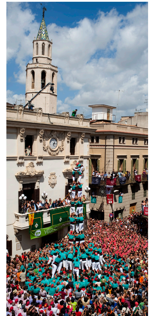
Castells in Vilafranca

If you're looking for an authentic Catalan experience, at the end of August take the train to the town of Vilafranca for its festa major . Not only will you get the chance to visit a pretty town at the heart of the Penedès wine region and enjoy the festivities that include traditional dances, processions and concerts but it's also an excellent opportunity to witness the incredible feats of different 'casteller', or human tower, groups. On August 30, the feast day of local patron Sant Fèlix, the main square fills with crowds of people both watching and building the castles – they're 'constructed' by participants climbing on top of each others' shoulders to get as high as they can; the castle is completed when the smallest child of the group gets to the top and raises their hand. Cue major applause from the spectators!