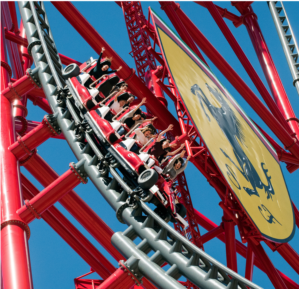
Ferrari Land. Port Aventura World

(Start: Av. del Paral·lel 60). M: Paral·lel (L2, L3). 6pm-