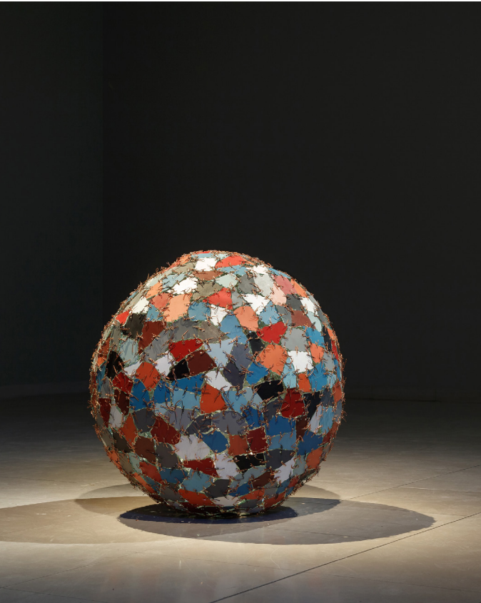
Chaos + Repair = Universe. Kader Attia. Fundació Joan Miró