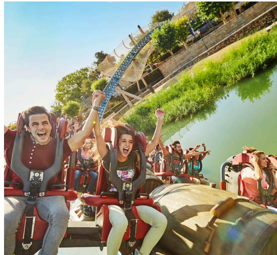
Port Aventura Park

If you're looking for a day bursting with fun, head to PortAventura World with its three amazing theme parks. PortAventura Park has rides, adventures and excitement for all ages spread over its six different worlds: Mediterranean, Mexico, Far West, China, Polynesia and Sesame Adventure. Over 40 attractions and 100 daily shows include roller-coasters, boat and train rides, parades, fireworks and 4D experiences. Fans of fast cars can't miss Ferrari Land , the first and only of its kind in Europe that celebrates the renowned Italian machines with a range of high-speed, adrenaline-pumping rides and activities. This year, a new Kids' Area has been opened so that younger devotees can get their own taste of the fast lane. And with the high August temperatures, what better place to cool down than PortAventura Caribe Aquatic Park ? Numerous slides, pools and two special beaches mean guaranteed thrills and spills in the water as well as the chance for chilling out. At Barcelona's tourist offices and on Barcelona Turisme's website you can buy three different tickets for PortAventura: transport to and from Barcelona in an air-conditioned coach and entrance to PortAventura Park; the same transportation plus entry to both PortAventura Park and Ferrari Land ; or, if you prefer, just your ticket to your choice of parks .