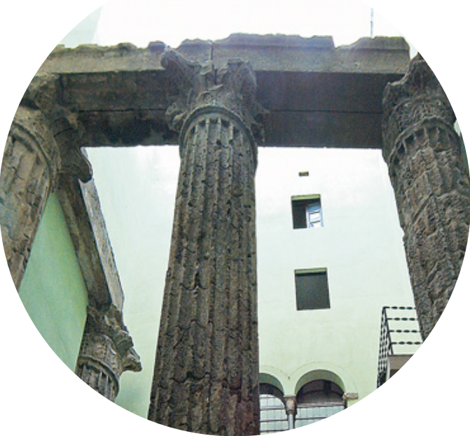
MUHBA Temple d'August