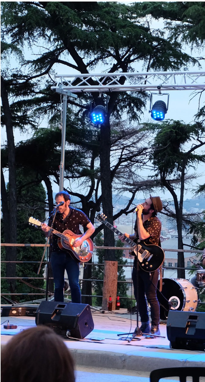
Blues nights at Poble Espanyol

Barcelona Tour BUY (Start: Turisme de Barcelona Tourist Information Point, Plaça Catalunya, 17, basement). M: Catalunya (L1, L3; FGC). Sat 5.30pm-10.30pm. From 44.10€ Combined walking and bus tour that includes many of Barcelona's most famous sights as well as supper at the Modernista Hospital de Sant Pau, the light, water and colour show of the Magic Fountain, and panoramic views of the city by night from Montjuïc.