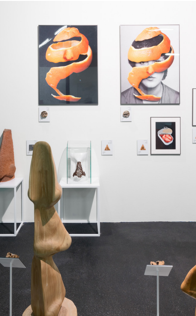
Nasevo. Museu de Ciències Naturals de Barcelona

a new piece featuring objects that are key to his creative process.