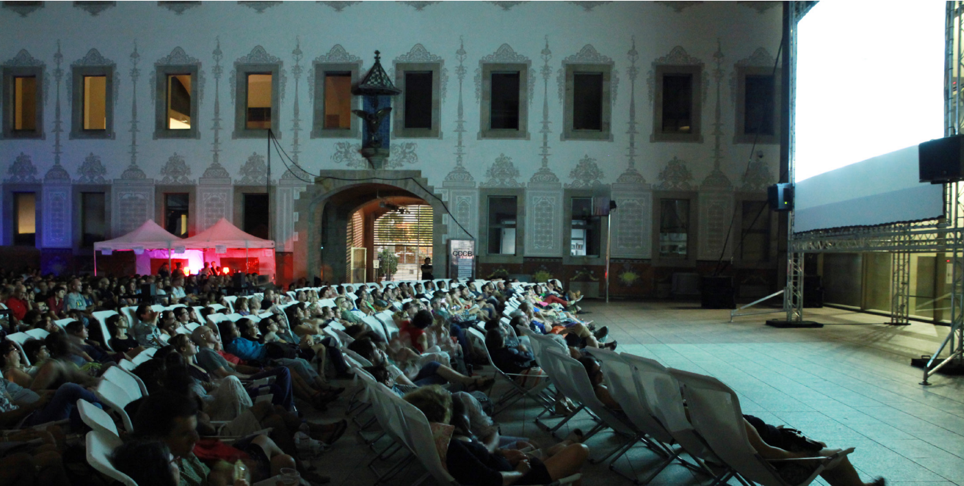
Gandules at CCCB