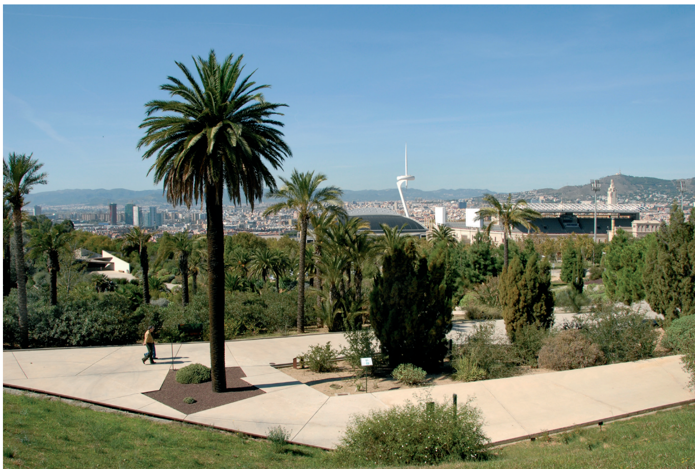
Parcs i Jardins de Barcelona / Jardí Botànic