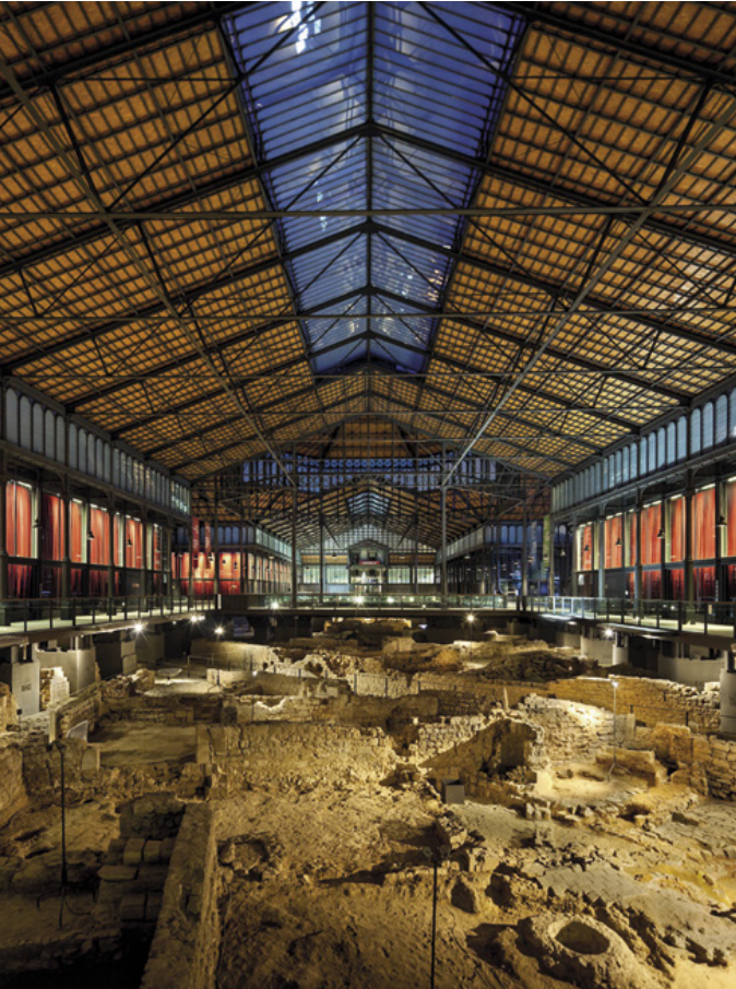
El Born Centre de Cultura i Memòria

(Isaac Newton, 26). FGC: Av. Tibidabo. Daily 10am-8pm. www.cosmocaixa.com