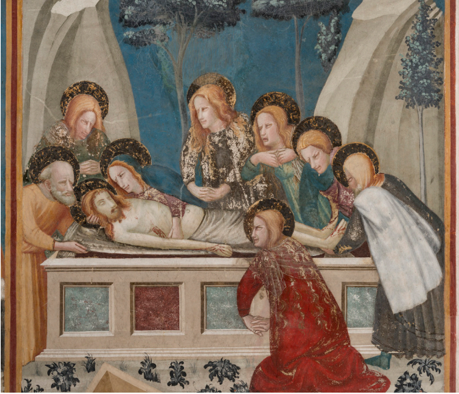
Divine murals. Reial Monestir de Pedrabes

(Montcada, 15-23). M: Jaume I (L4). Mon 10am-5pm; Tue-Sun