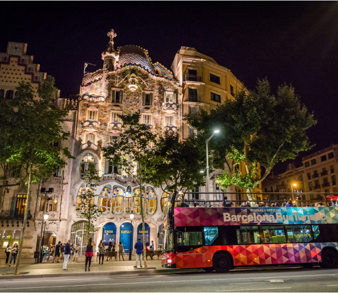
Barcelona Nigth Tour

ning of La Pedrera: Wed, Thu, Fri (Eng) 8am; 39€. Many Barcelona inhabitants believe this is Gaudí's true masterpiece. The wavy lines of its façade, the stunning roof terrace and original interior features are not to be missed.