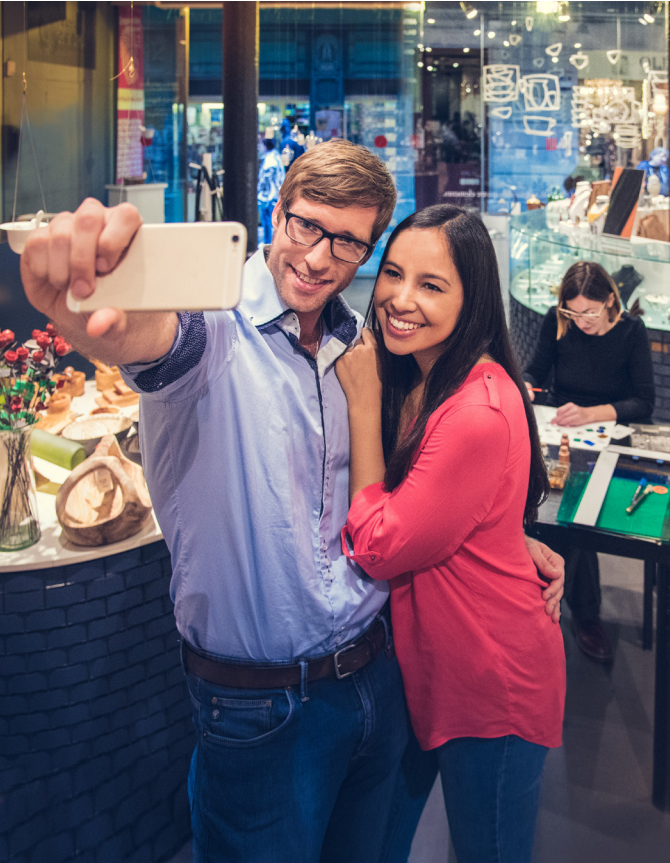
Barcelona Genuine Shops

Poble Espanyol BUY (Av. Francesc Ferrer i Guàrdia, 13). M: Espanya (L1, L3; FGC). Mon 9am-8pm; Tue-Thu, Sun 9am-midnight; Fri 9am-3am; Sat 9am-4am. From 6.30€. Architecture from around the country at this 'Spanish village'.