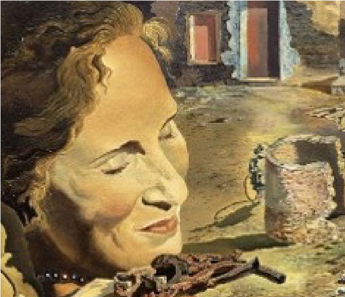
Gala Salvador Dalí. Museu Nacional d'Art de Catalunya