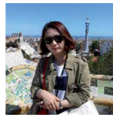
Deason Park • SOUTH COREA