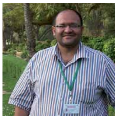
Aly • EGYPT