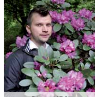
Edgars • LATVIA