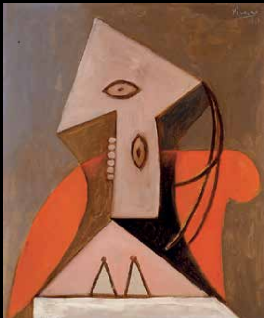
Successio Pablo Picasso, Florida