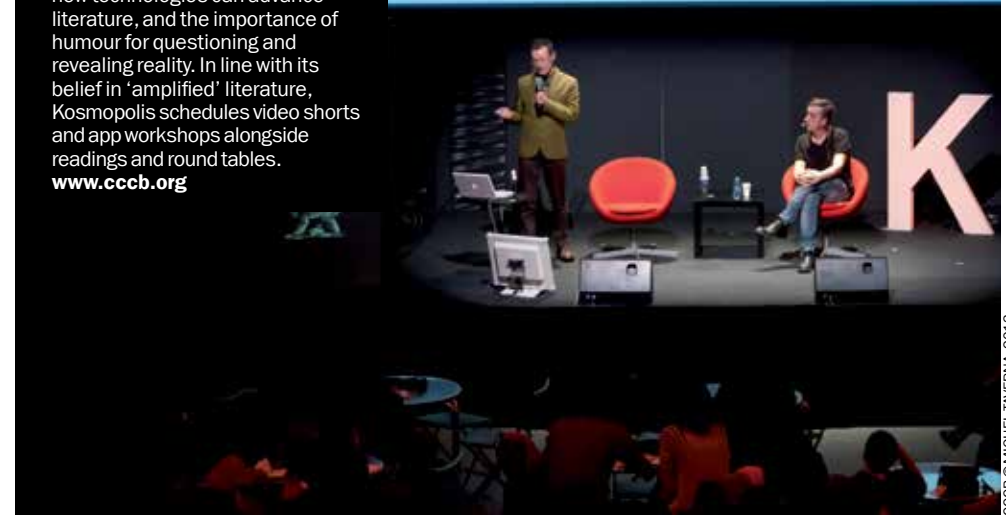
CCCB © MIQUEL TÀVERNA, 2013