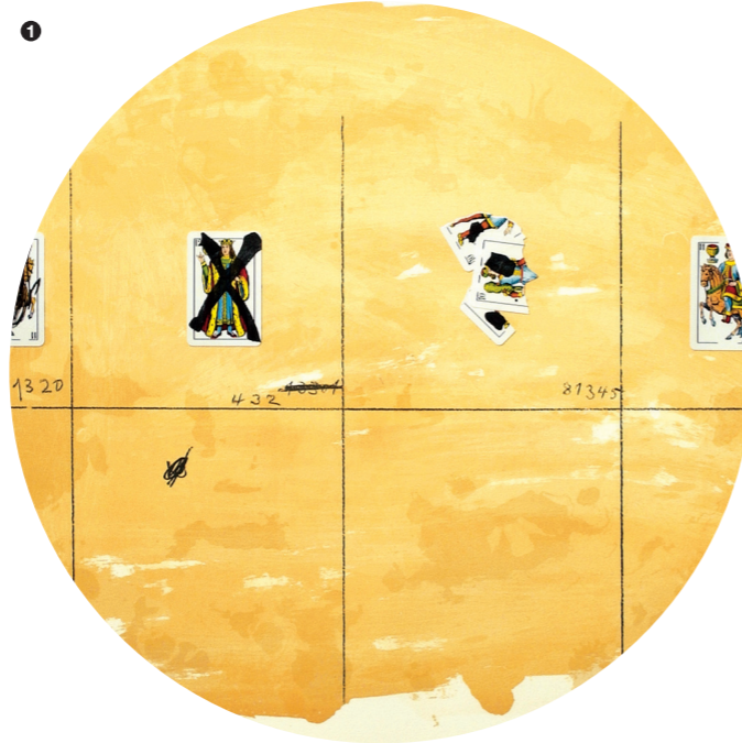
T for Teresa. Fundació Antoni Tàpies

(Plaça dels Àngels, 1). M: Universitat (L1, L2), Sant Antoni (L2). Mon, Wed-Fri 11am-7.30pm. Sat 10am-8pm; Sun and public holidays 10am-3pm. Closed Tue (except public holidays). May 18 and Sat 4pm-8pm, free. www.macba.cat