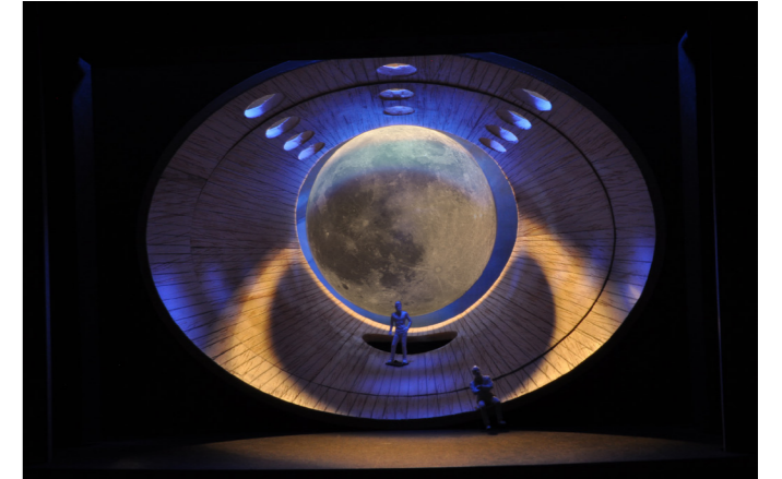
Demon. Gran Teatre del Liceu