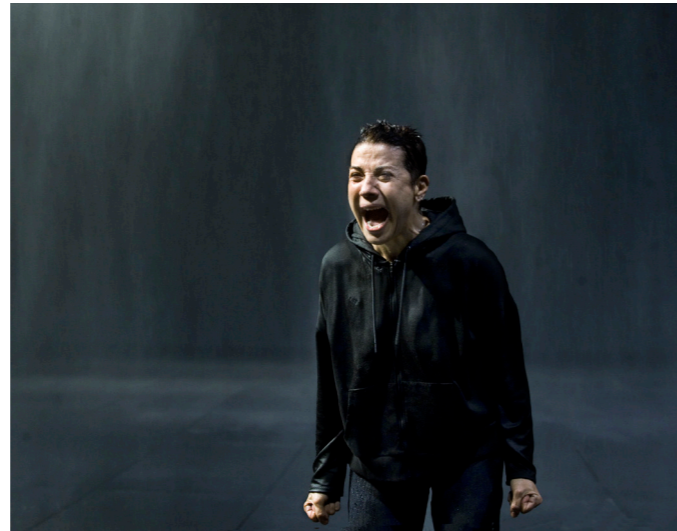
Medea. Teatre Lliure

May 16-Jun 3. Tue-Fri 8.30pm; Sat 7pm; Sun 6pm. €13.50-€26.50. Twelve characters whose stories overlap show life in a city that's a border