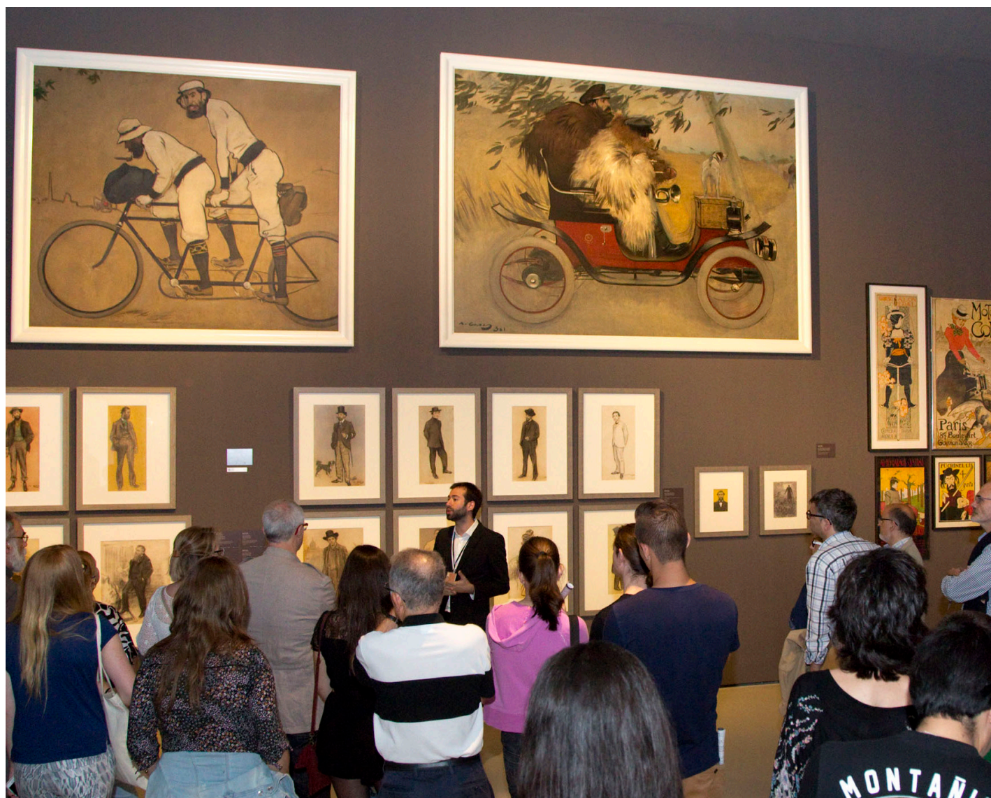
Museu Nacional d'Art de Catalunya