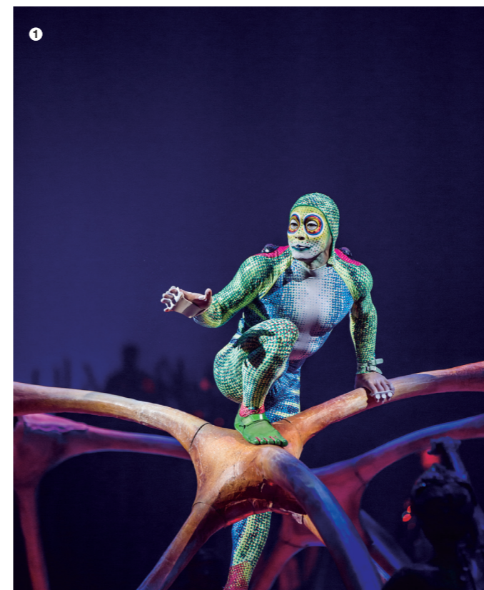
Totem. Cirque du Soleil

May 9-13. Wed-Fri 8.30pm; Sat 6pm, 9pm; Sun 6pm. €27-€45. The St. Petersburg Festival Ballet performs the Tchaikovsky classic, which is an eternally popular ballet.