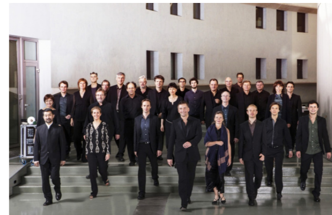
Mahler's Fourth. L'Auditori