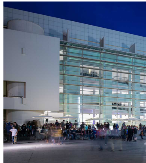
Museu d'Art Contemporani de Barcelona

www.barcelonaturisme.com www.lanitdelsmuseus.cat