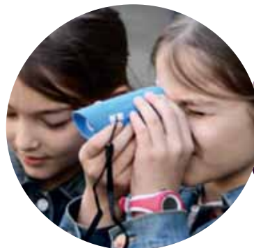
BARCELONA FAMILY TOURS

Runner Bean Tours gives you the opportunity to enjoy a magical walk through Barcelona's historic quarter with your family, accompanied by songs, dances, legends and stories. Have fun on this tour while you learn... you'll even be able to sample delicious sweets.