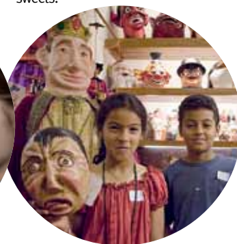
KIDS AND FAMILY WALKING TOUR