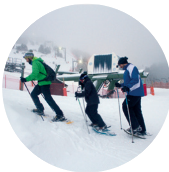
ALPINE SKI RESORT

→ The Vall de Núria ski and mountain resort is a unique treasure trove of nature and landscape. Take the unique rack railway along 12.5 km and have the chance to visit the viewing point and go on a guided snowshoe tour around the shrine. Enjoy the winter high up in the mountains!