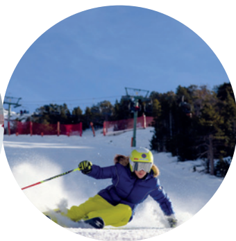
VALL DE NÚRIA