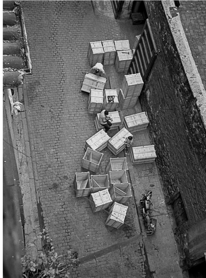
Carrer d'en Carassa.

Until Jun 10. Explore the mysteries of the Cosmos with this exhibition of two parts: 'Light Years' and 'Other