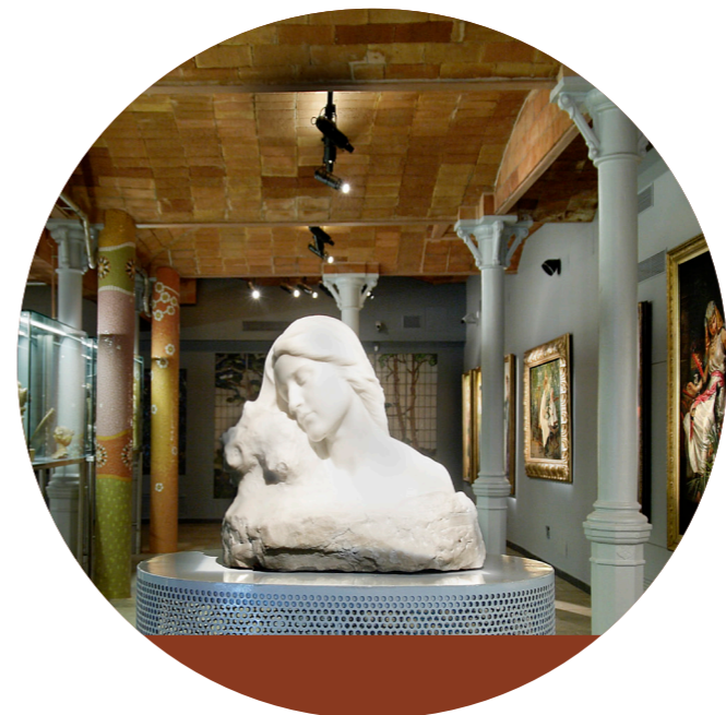
Museu del Modernisme de Barcelona

sculptures from the 20th and 21st centuries.