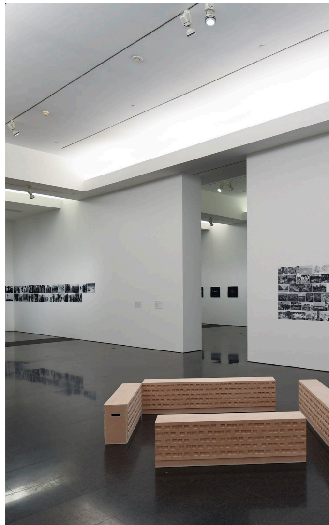
Domènec. MACBA.

Daily 10am-8pm. www.gaudiexhibitioncenter.com