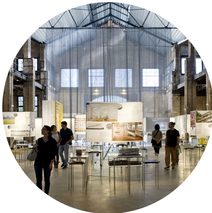
Interrogate Barcelona. MUHBA Oliva Artés