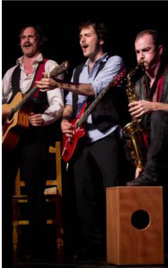
Be God Is. Teatre Lliure.

Jun 28-Jul 15. Wed 7pm; Thu-Sat 8pm; Sun 6pm. €19.50-€23. From 14 years. Two young Catalan actors and directors take the Shakespearean character of Falstaff as inspiration for this