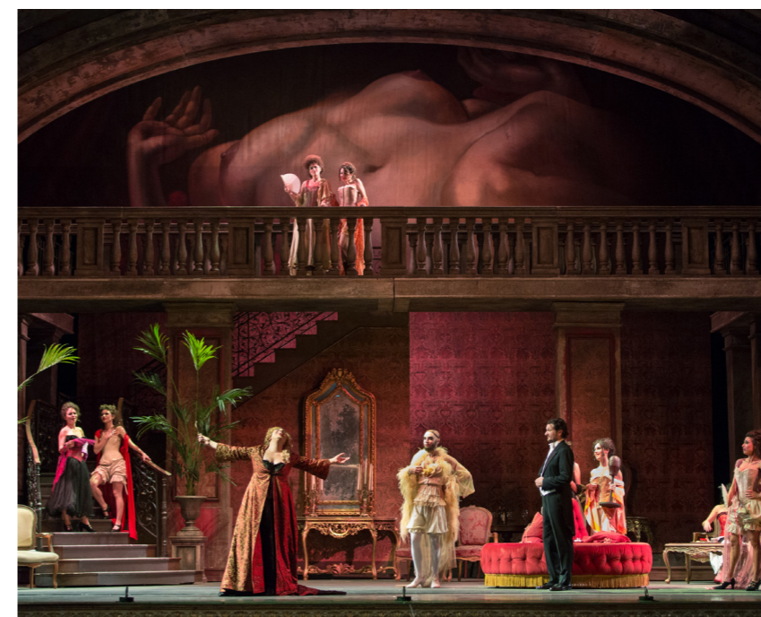
Manon Lescaut. Gran Teatre del Liceu

This is a great month in Barcelona for classical music aficionados with a series of world-class concerts making up the end-of-season schedule for Barcelona Obertura Classic & Lyric ; this initiative aims to showcase the city's excellent venues for opera, recitals and choral music ( www.barcelonaobertura.com ). The week of music begins with conductor Kazushi Ono leading the Barcelona Symphony Orchestra in its first ever rendition of Dvorak's 'Requiem' (L'Auditori, Jun 3). Next on the programme is renowned French tenor Philippe Jaroussky , who returns to the Palau de la Música Catalana following a successful appearance last year to take the principal male role in Gluck's 'Orfeo ed Euridice' (Palau de la Música, Jun 5). Bringing the current season at Barcelona's magnificent Liceu opera house to an end is a production of Puccini's ' Manon Lescaut ' and the opening evening is part of the Barcelona Obertura Classic & Lyric line-up (Gran Teatre del Liceu, Jun 7. See more shows at www.liceubarcelona.cat ). The following evening, prestigious British conductor Sir Simon Rattle leads the Berlin Philharmoniker (Palau de la Música Catalana, Jun 8). And rounding off the event is an evening of beautiful Händel music with the Hesperion XX orchestra and Catalan conductor Jordi Savall (L'Auditori, Jun 10).