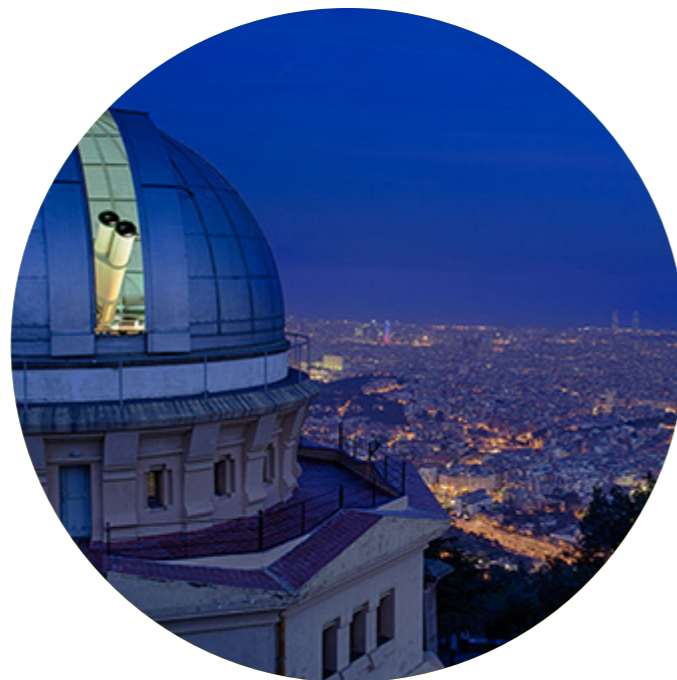
Sopars amb estrelles