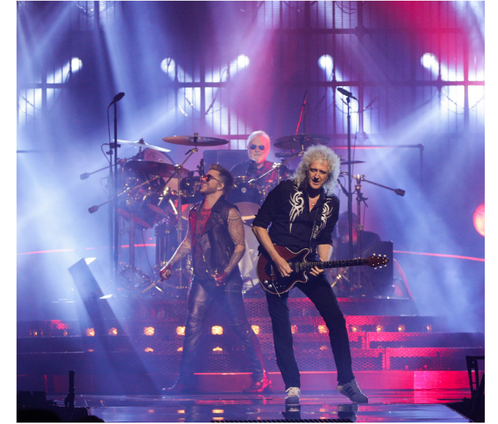
Queen + Adam Lambert. Palau Sant Jordi

(Balmes, 139). M: Diagonal (L3, L5); Provença (FGC). Daily 6pm, 7.50pm, 9.40pm (shows start later). Options: show only, show + drink, show + different menu options (including tapas). www.palaciodelflamenco.com/?lan=en Live flamenco every evening.