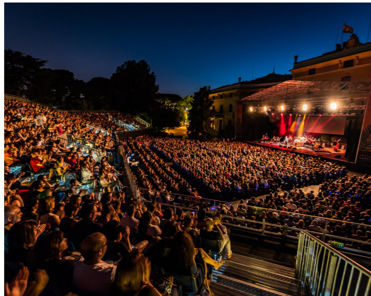
Festival Jardins de Pedralbes

June in Barcelona sees festival season really hotting up, in all senses of the word, as the thermometers start to rise. Undoubtedly one of the biggest events of the month is Sónar , the music, creativity and technology festival – and this year it's set to be better than ever as it celebrates its 25th edition. The line-up for its By Day and By Night performances is truly enticing with Gorillaz, Thom Yorke, 2manydjs, Miss Kittin, Laurent Garnier and LCD Soundsystem among the long list of stars set to appear. But Sónar is much more than its concerts. An exhibition showcases Sónar artwork from the past 25 years while Sónar+D gives professionals the chance to explore new technologies and business in the creative sector (Jun 14-16; www.sonar.es ). Another major festival that kicks off this month is the Festival Jardins de Pedralbes . Taking place in the beautiful gardens of the Royal Palace of Pedralbes, going to an evening concert there by the likes of Simple Minds (Jun 11), Mariza (Jun 13), Sara Baras (Jun 14, 16), Jessie J (Jun 19), Tom Jones (Jun 24), Jeff Beck (Jun 28) or ZAZ (Jun 29) is a memorable experience. (Jun 6-Jul 13; www.festivalpedralbes.com ).