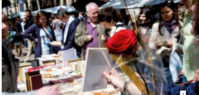
1. Bookstand on La Rambla.

These activities are just a warm-up for the big event on April 23, Sant Jordi , the day of Catalonia's patron saint. The date also commemorates the death in