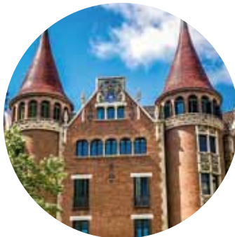
CASA DE LES PUNXES

→ Do you want to visit the settings for two novels that have captivated thousands of readers? You can't miss these two literary trails that take you on a journey through the magical Barcelona of "The Shadow of the Wind" and the fantastical Barcelona of "The Cathedral of the Sea".