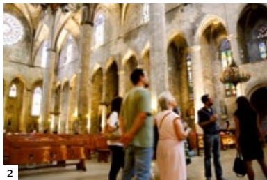
1. The Shadow of the Wind tour. 2. Cathedral of the Sea tour.