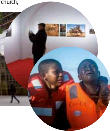
© SANITI PALACIOS. 'LEFT ALONE'. SECOND PRIZE IN GENERAL NEWS

CCCB hosts World Press Photo until June 5.