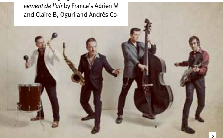
1. Dance show by Alonzo King. 2. Los Mambo Jambo.