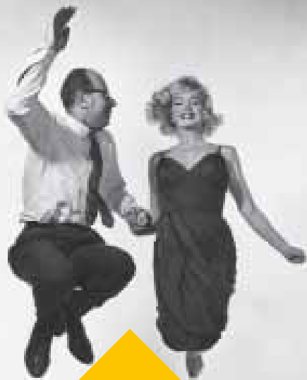
PHILIPPE HALSMAN & MARILYN MONROE, 1954