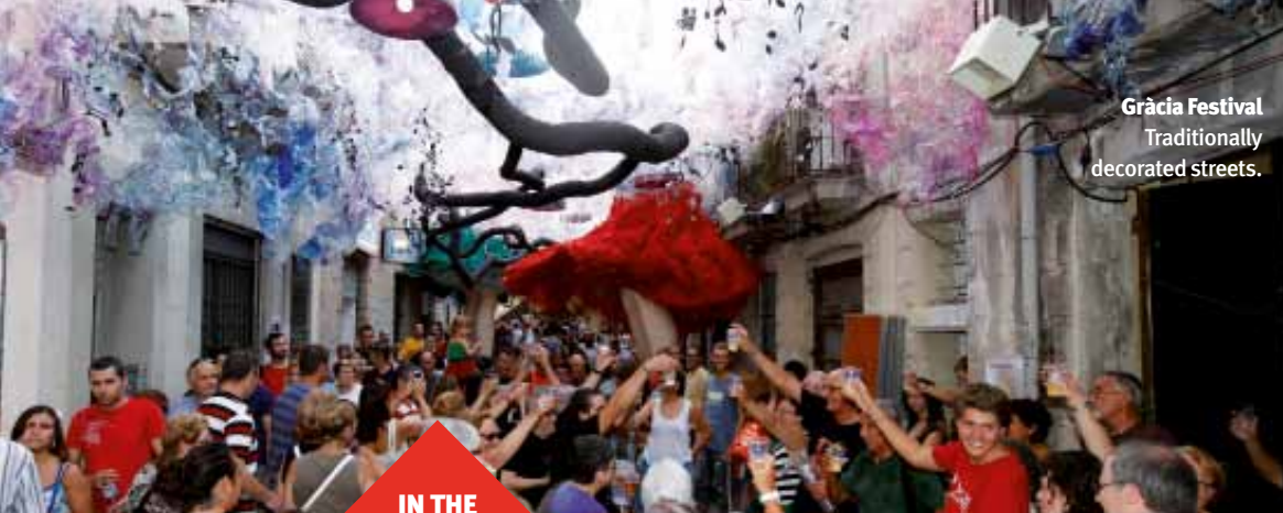
Gràcia Festival Traditionally decorated streets.