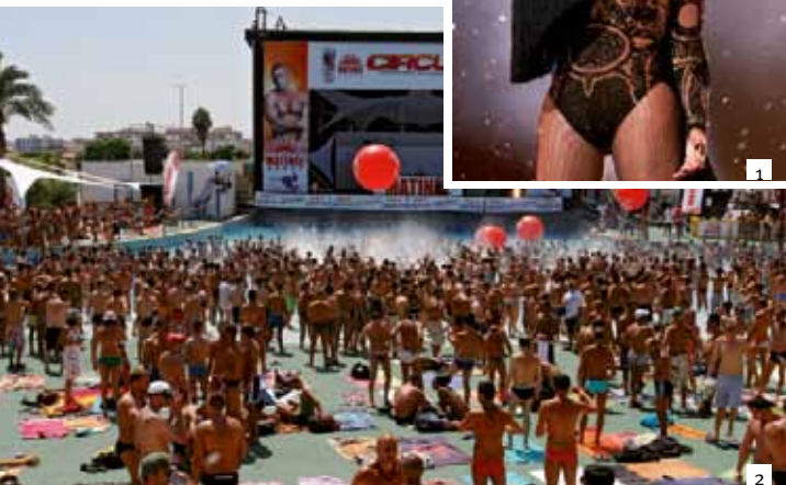
1. Beyoncé performing at Olympic Stadium on August 3. 2. Circuit Festival.