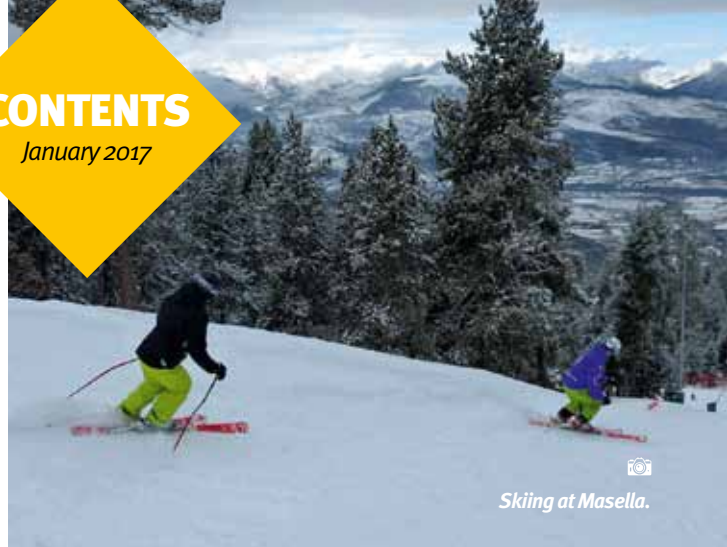
Skiing at Masella.

Enjoy the flavors while discovering history.