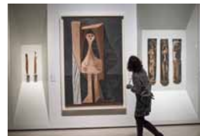
'Picasso and Romanesque Art'.

BARCELONA'S ART GALLERIES CONSTANTLY DEMONSTRATE THE CITY'S DYNAMISM AND CREATIVITY WHEN IT COMES TO INNOVATIVE PROPOSALS