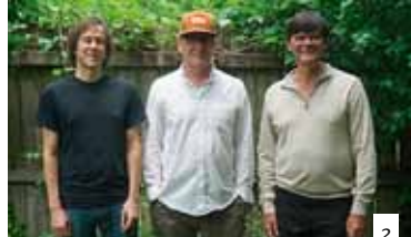
1. Valery Gergiev. 2. Lamb Chop.

There is even more quality classical music at L'Auditori on January 28 and 29. Gergiev will conduct the Mariinsky Theatre Orchestra and Barcelona Symphony Orchestra (OBC) per-