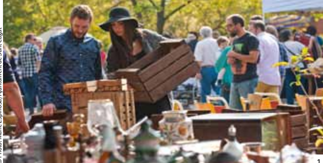
1. Mercantic in Sant Cugat del Vallés. 2. Wine and cheese pairing.

and the remnants of its defensive walls. If you do decide to visit, you should also visit Mercantic , a leading antique market.