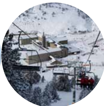
VALL DE NÚRIA

Buy your tickets at: tickets.visitbarcelona.com